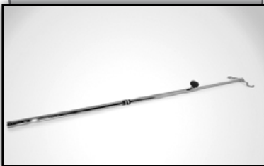
Model #6130 IV Pole