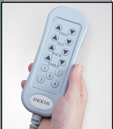
Model #6145 Programmable Hand Control