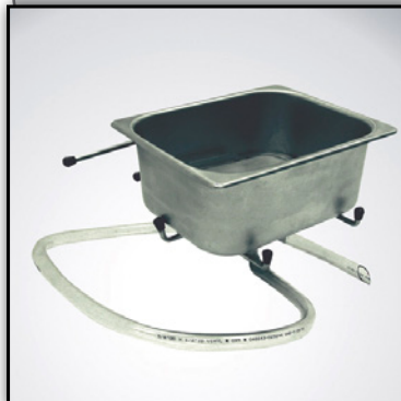
Model #6137 Urology with Screen, Drain & Hose