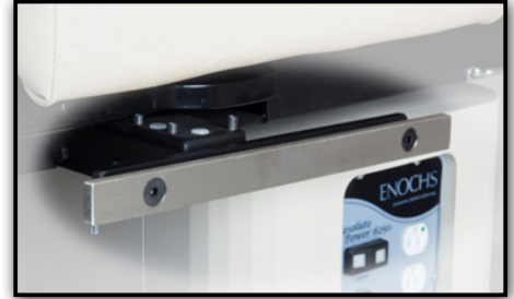
Model #6112 Base Rails (pair)