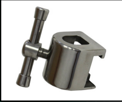
Model #6109 Universal Clamp