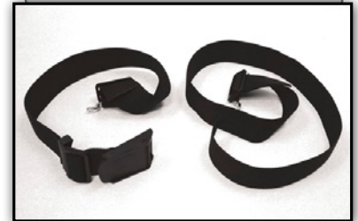
Model #6126 Restraint Straps