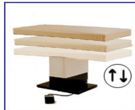
Table quickly and smoothly adjusts in height from a low 23" to a full table height of 39". The table provides low access for disabled and geriatric patients in wheelchairs and those using walking aids. The low access point also reduces back stress or injury of staff assisting patient on or off the table. The height adjustment range of 16" allows physician or staff member to position patient at convenient working height.

The extra wide 32" top of the Power 2000 makes it an ideal high-low table for general treatment, physical therapy and casting. The one-piece upholstered top is free of cross seams and decorative embossing which promotes quick efficient cleaning after each patient. Top is padded with 1½" of high-density foam for patient comfort.